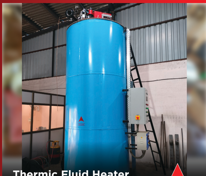
Thermic Fluid Heater Dual Fuel Oil/Gas