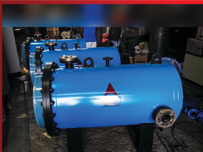
Electrical Thermic Fluid Heater