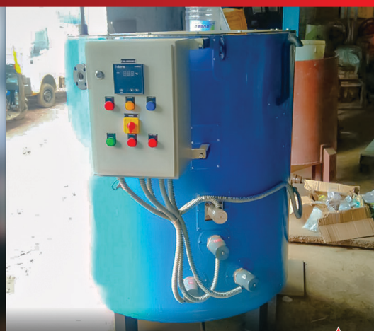
Electrical Hot Water Boiler/ Hot Water Generator