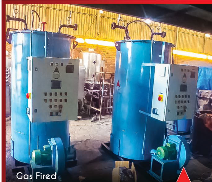
Gas Fired Thermic Fluid Heater