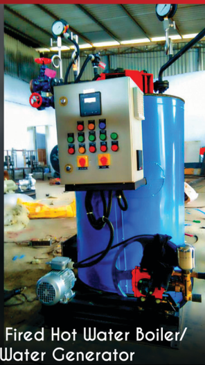
Gas Fired Hot Water Boiler/ Hot Water Generator