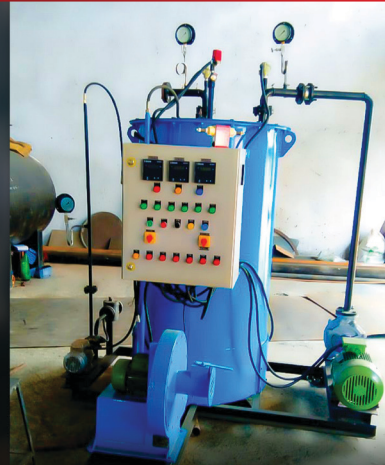
Oil Fired Hot Water Boiler/ Hot Water Generator