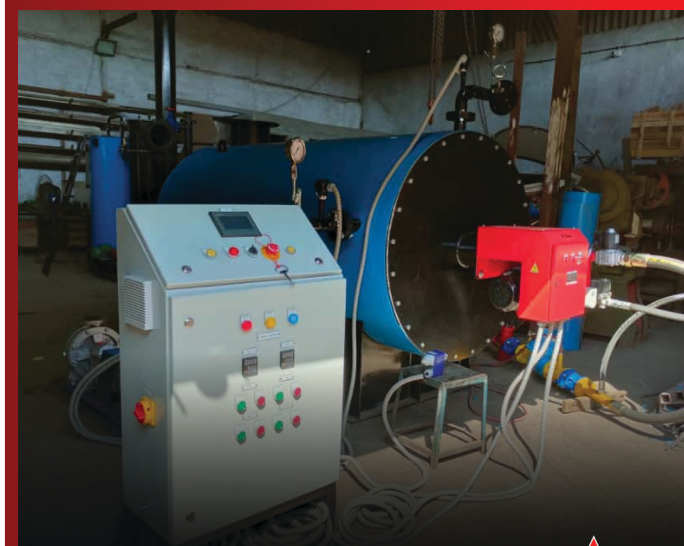
Thermic Fluid Heater Dual Fuel Oil/Gas